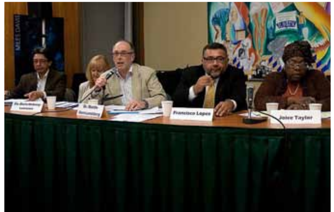
Workers' Rights Board hearing on Nike's labor practices in Honduras, April 2010

Nike Workers win in Honduras In mid-March, the United Students Against Sweatshops contacted Portland Jobs with Justice, asking for help in a campaign they called Nike Just Pay it! Workers at two Honduran factories which produced apparel for Nike, had suffered plant closings with no notice and no severance pay (required under Honduran law). The 1700 workers were organizing unions when the plants closed and were owed $2.2 million in severance and health care benefits. Portland JwJ chose to convene a Workers' Rights Board hearing and invited Nike to come and testify. Nike politely declined to come. Two workers, one from each factory, came to the hearing and told their stories to a WRB panel, a crowd of about a hundred and the local media. Three days after the hearing, at the May Day march, a Nike Just Pay It banner was unfurled from the top of the NikeTown building as the march stopped in front of it. Three months after the hearing Nike and the Honduran unions reached an agreement that Nike would pay the workers what was owed them. This was historic: it was the first time industry leader Nike had taken responsibility for the actions of its contractors. Colleges and universities around the country and the world had started looking at whether or not Nike's factories were in violation of university sweat-free codes of conduct and Cornell University and the University of Wisconsin had severed contracts with Nike.