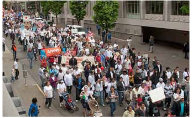
May Day march puts thousands in the street, May 2010

The Portland JwJ Health Care Committee has worked hard to educate and organize around a single payer plan, expanded and improved Medicare for all, everybody in/nobody out. In early 2010, as the Congressional debate on health care reform wound down, the health care committee