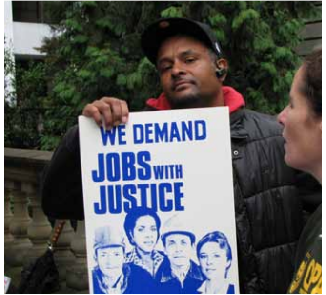
City hall vigil of the unemployed, October 2010