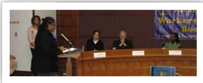
Securitas Workers Rights Board Hearing, December 2010