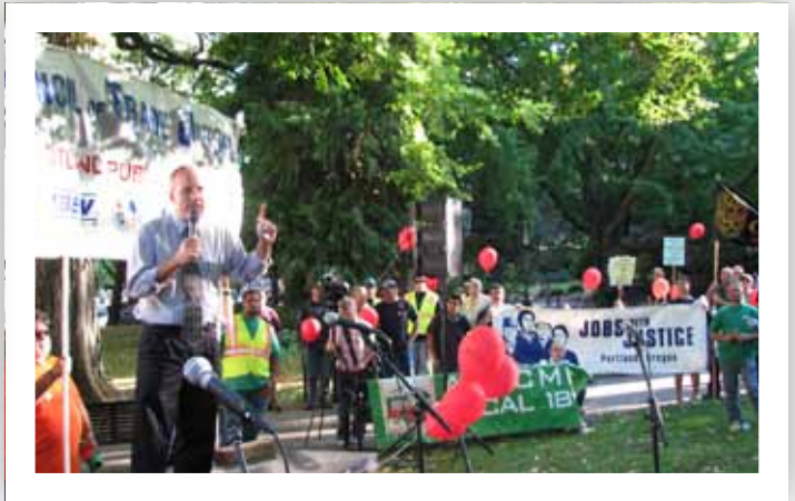
Support for the City of Portland workers' contract, September 2010

Grocery Workers' Contract Victories! At the end of January 2010, UFCW local 555 successfully settled their grocery contract with help from Portland JwJ. The union organized over 75% of the bargaining unit to sign a petition supporting key bargaining demands: living wages, affordable health care and pension rights. The union engaged Portland Jobs with Justice in leafleting stores and talking to management and we recruited faith leaders to visit stores. The petitions were presented to management across the bargaining table in January 2010 and the contract was settled shortly afterward.