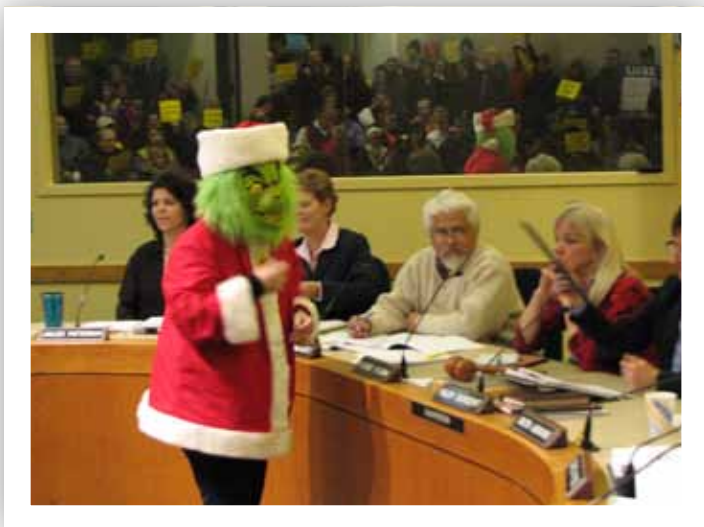
The G*inch delivers a special award to the school board, December 2009

PPS custodians and nutrition service workers win SEIU represented school custodians and nutrition service workers fought another contract battle in 2010. They had just asked JwJ for help and we had turned out pledgers for a first community informational picket when a tentative agreement was reached in October. We were proud to once again support these workers who had successfully got their contracted out jobs back in 2007 after a multi-year legal struggle.