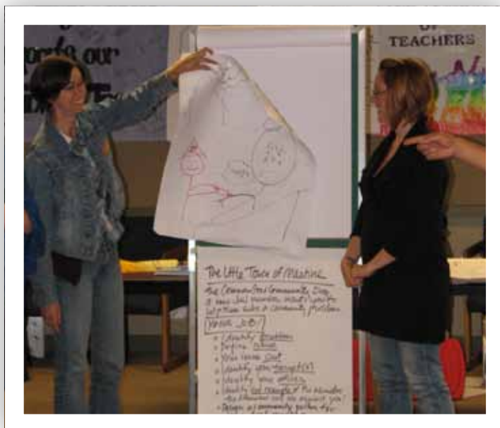
JwJ national training in Portland, August 2010