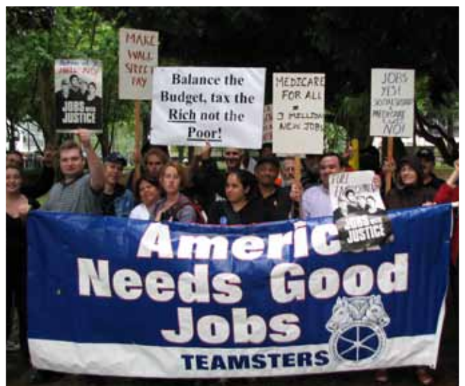
National Day of Action about the Jobs Emergency, September 15, 2010