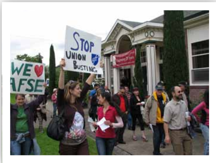
Protesting union busting at the French School, August 2010