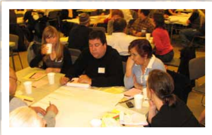
JwJ forum on principles for comprehensive immigration reform, March 2010

The campaign then moved on to the non-foods contract: workers in variety, apparel, and all the other sections of Fred Meyer. These workers have typically made less than their counterparts in grocery. The union and JwJ recruited hundreds of community leaders to support the campaign and several delegations of faith and community leaders presented the petitions to management at two stores in August. This community support was critical in reaching the successful settlement in November.