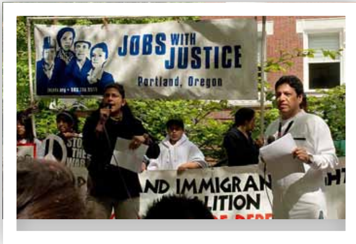
Workers' Rights/Immigrant Rights, May Day 2010

the airline industry and are fighting concessionary proposals from management. In 2010 we turned out our most active members for a rally at a park on 82nd, and then a rally and march across from SkyChefs facility out at the airport. The workers are very engaged in fighting for a fair contract and we will be there as long as it takes.