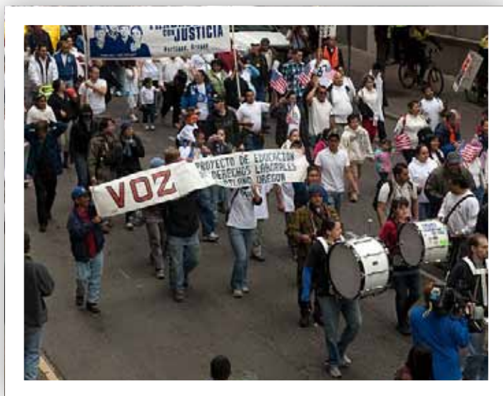
May Day March 2010

We continued our work with the Oregon Fair Trade Campaign, focusing on educating our Congress people about the Trade Act and organizing opposition to the Peru, Korea, and Colombia Free Trade Agreements. We did not succeed in getting Representative Kurt Schrader signed on to the Trade Act, but we did get him to reconsider and soften his free trade stance. We co-sponsored and turned out people for several educational events on the Korea FTA, including a tour by a Korean trade unionist. The struggle against the Korea FTA continues.