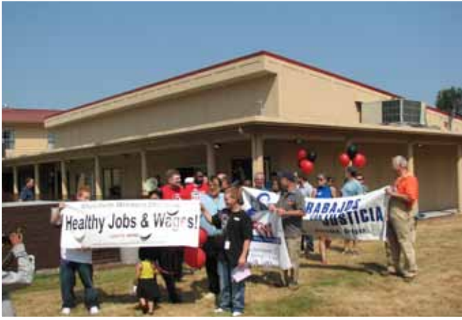
Solidarity with Skychefs workers in their contract campaign, August 2010

when there's a domestic violence situation, for example. The coalition of organizations working on police-ICE collaboration issues started doing research into what existed in Oregon and found that Multnomah County and a number of other counties were routinely communicating information to ICE. The Safe Communities Project was born to investigate and advocate for an end to this kind of collaboration. Working with PCASC, the ACLU, Voz, AFSC and the Immigrant Law Project, the Safe Communities Project has met with County commissioners and the Multnomah County Sheriff and is working to slow the rate of deportations and, as much as possible, end local collaboration between local law enforcement and ICE.